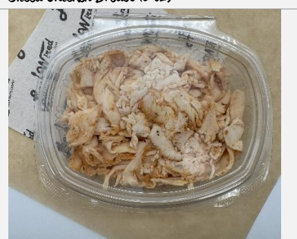
Our Wired roasted chicken breast sliced thin perfect for extra protein or simple snack