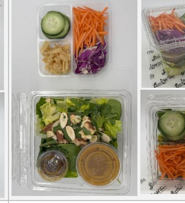
Chopped romaine, spinach, red cabbage, cucumber, carrots, bell peppers, cilantro, almonds, fried wontons, teriyaki glaze and Ponzu Vinaigrette