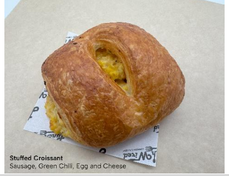
Sausage, green chili, scrambled eggs and cheese folded together in a handheld croissant