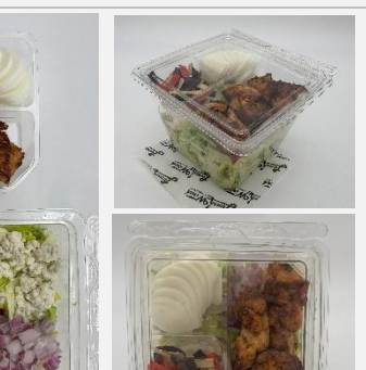
Fajita seasoned chicken, hard boiled egg, gorgonzola cheese, red bell pepper, red onion, romaine lettuce, Ranch dressing and tortilla strips