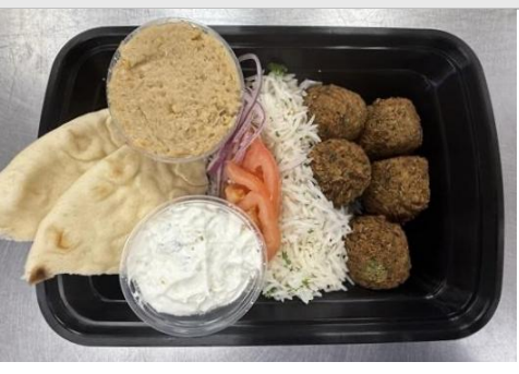
Vegetarian chickpea falafel served w/lemon herb rice, pita, red onion, tomato, Tzatziki & hummus