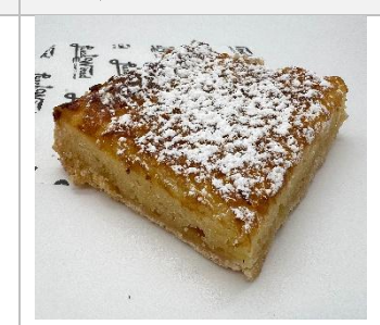
$3.85/ea (min 3)