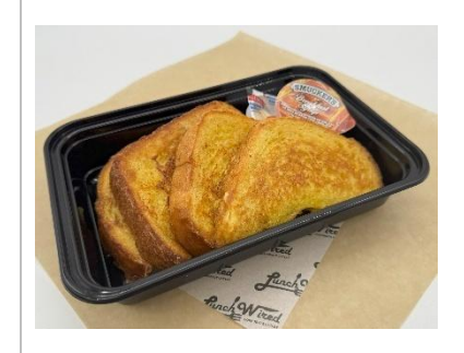
Challah French toast served with maple syrup and butter