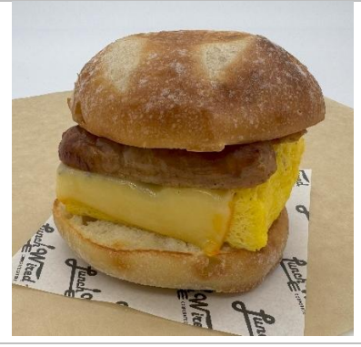
Scrambled eggs, Muenster cheese, breakfast sausage on a griddled bun