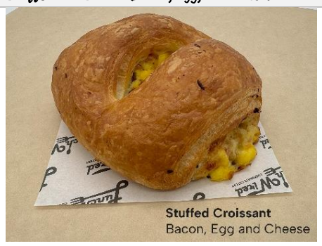
Smoked bacon, scrambled eggs and cheese folded together in a handheld croissant $6.85/ea (min 6)

Stuffed Croissant-Bacon, Egg, and Cheese