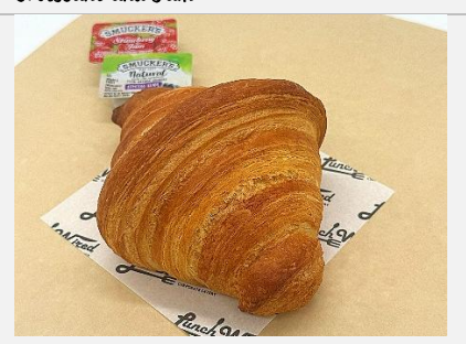
Fresh baked croissant served with strawberry iam