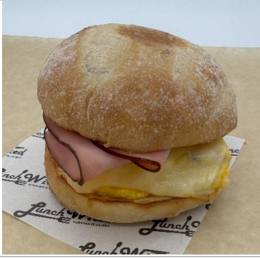
Scrambled eggs, Muenster cheese, ham on a griddled bun