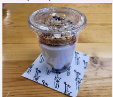
Vanilla yogurt, almond cranberry granola, blueberries, peach, and strawberries