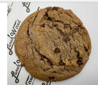
$2.25/ea (min 5)