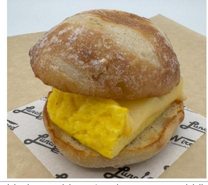
Scrambled eggs, Muenster cheese, on a griddled