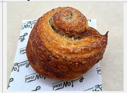
Butter croissant swirl with brown sugar and cinnamon