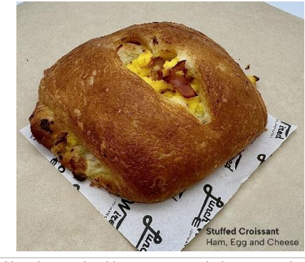
Classic smoked ham, egg and cheese croissant wrapped in fresh baked croissant