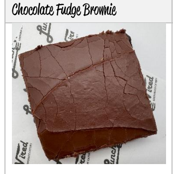
$3/ea (min 5)