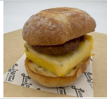
Scrambled eggs, Muenster cheese, veggie sausage on a griddled bun