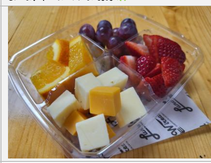
Grapes, strawberries, oranges, Cheddar, Swiss and Pepper Jack Cheeses