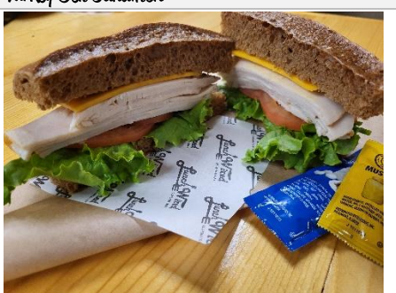
Available on Challah or Multi Grain

Turkey, Cheddar cheese, lettuce and tomato. Served on house baked bread w/mayo and mustard on the side