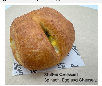
Spinach, scrambled eggs, and cheese folded together in a handheld croissant

Stuffed Croissant- Spinach, Egg, and Cheese (V)