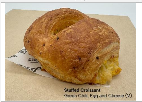
Vegetarian green chili, scrambled eggs and cheese folded together in a handheld croissant