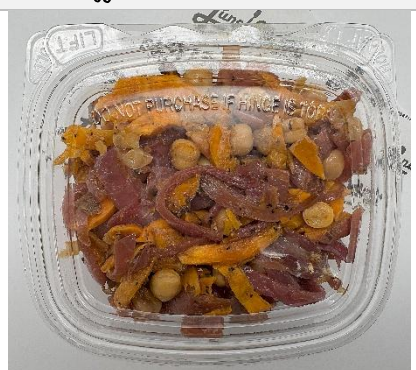
Roasted sweet potato, red onion, and garbanzo beans