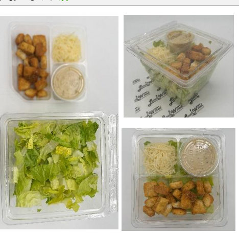
Chopped romaine, house made Caesar dressing, Parmesean cheese and garlic croutons