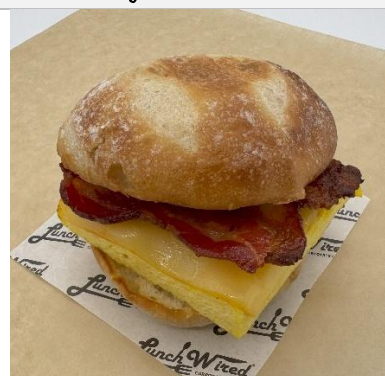
Scrambled eggs, Muenster cheese, smoked bacon on a griddled bun $8.95/ea (min 5)