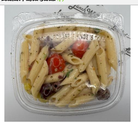
Pasta tossed in our tangy house made Greek dressing, pepperoncini, kalamata olives, artichoke hearts and cherry tomato $4/ea (min 5)