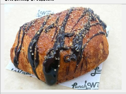
Classic chocolate croissant topped with chocolate ganache and cane sugar $4.95/ea (min 6)

Stuffed Croissant-Bacon, Egg, and Cheese