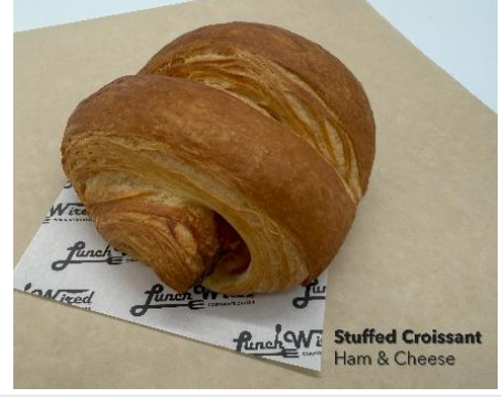
Classic smoked ham and cheese croissant wrapped in fresh baked croissant