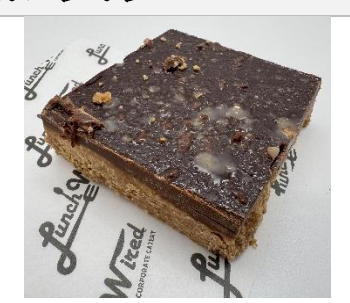
$3.25/ea (min 3)