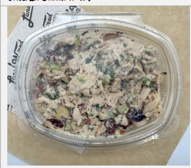
Wired Chicken Salad with almonds, celery, red onion, cranberries, cilantro, basil, red wine vinegar, seasonings- Client Favorite!