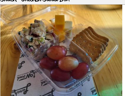
Wired Chicken Salad (Almonds, celery, red onion, cranberries, cilantro, basil, red wine vinegar, seasonings), grapes, Cheddar cheese, Pepper Jack cheese and crackers $7.75/ea (min 5)